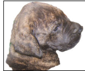
pup Cleopatra Gouda